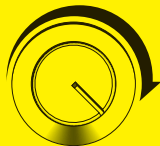
Turn Device Volume Up

Thank you for your purchase and enjoy your Tower Wireless Speaker!